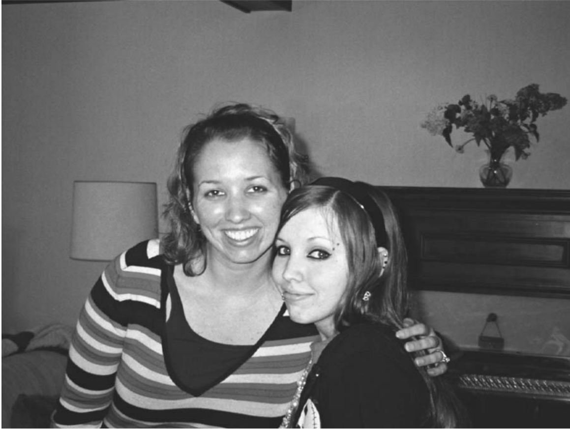
Figure 3. “My adopted inspiration”

life. She sets a good example for me, which helps me carry on my success in school. She has completely surpassed her duty as a “big sister.” She has impacted my life by encouraging me to pursue my dreams—even as they have changed from an artist to a forensic pathologist and everything in between. She has always been there for me.