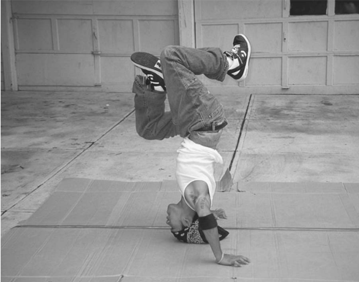
Figure 1. “Teachers who trust you”