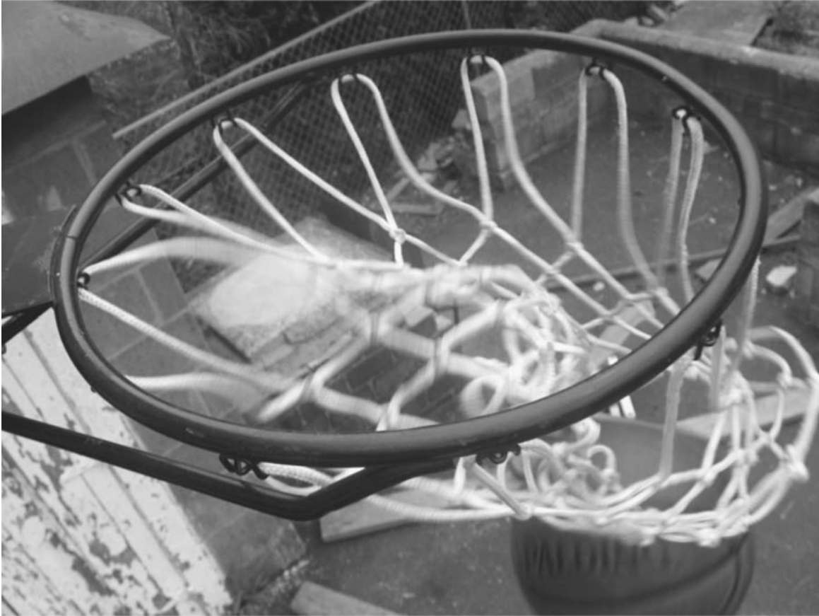
Figure 2. "Opportunity"

be traditionally dismissed as flighty by some teachers.